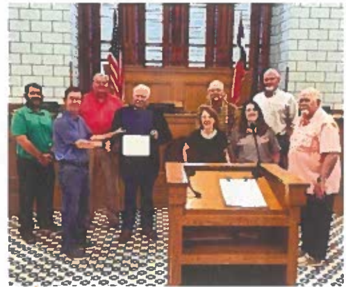
Fannin CHC receives a 2023 Distinguished Service Award from county commissioners court

Please ask county staff to complete the CHC appointee roster template noted above in Microsoft Excel and email the roster to chcoutreach@thc.texas.gov .