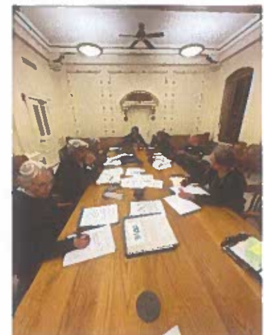
Bell CHC Meeting, February 2024