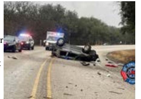
close its schools in an overabundance of caution. Icy roads on Highway 83 near Concan may have been a contributing factor in a vehicle accident oc-

Utopia ISD had announced it would delay the start time of its schools by 2 hours but then decided to