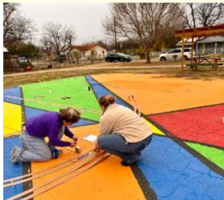
Rotary Club of Uvalde volunteers apply paint to the basketball court surface last Saturday.

Rotary Club of Uvalde members returned to DeLeon Park with paint and brushes Saturday morning, January 30th to finish painting the basketball courts near the new Kaboom! Playground that was built by volunteers of all ages from Uvalde and the surrounding areas.